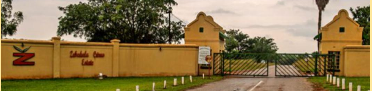
The Zebedelia citrus estate created by the Schlesinger family in the Northern Transvaal.

Were your parents or grand or great-grandparents or any family members involved with farming or agriculture in South Africa? There are so many amazing Jewish innovators in this under researched area of South African Jewish history.